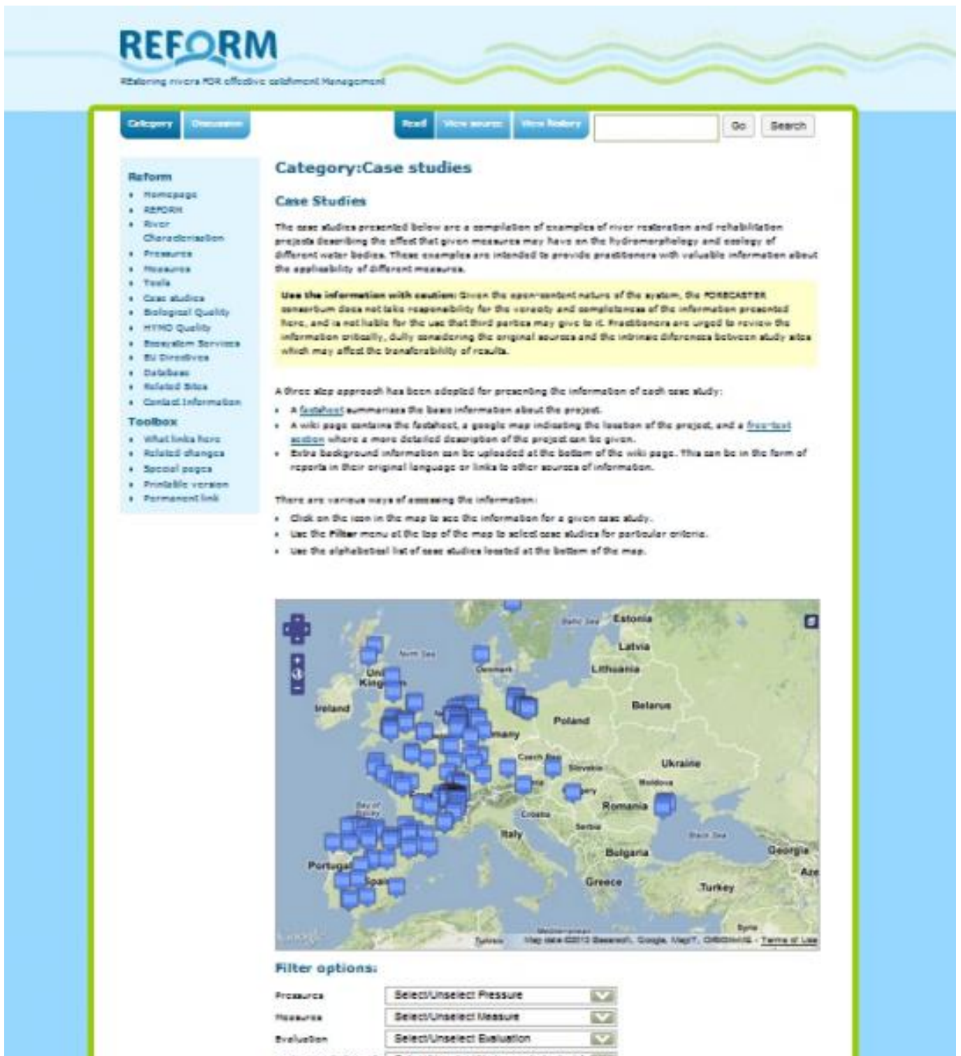
Figure 1. Case-study page of the REFORM wiki.

The REFORM wiki presents generic river restoration knowledge and specific restoration case studies, using the same technology as Wikipedia. The contents are organized in layers with increasing levels of detail. Interactive maps of case studies across Europe (Figure 1) form the portal from which live links provide access to other case studies as well as related background information in thematic sections (knowledge components in Figure 2).