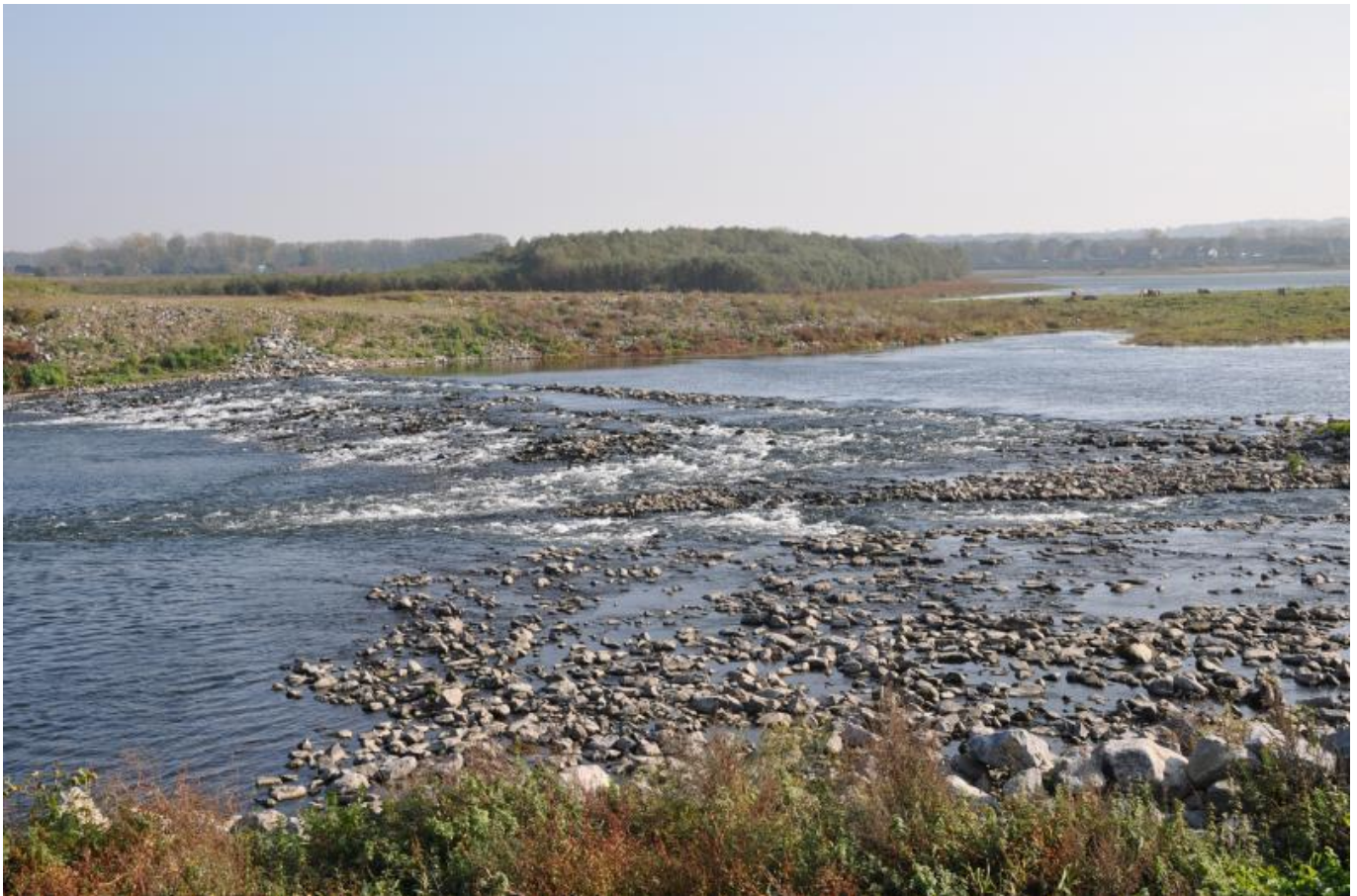
Figure 1. Coarse gravel habitat that is maintained by high flow velocities and stream power.

To provide practical guidance for river assessment and rehabilitation, the complex interactions between various hydromorphological (HYMO) processes and variables and the response of stream biota were pragmatically reduced to key structures, mechanisms, and cause-effect chains. For example, high flow velocities physically limit habitat use by weak swimmers, and high stream power maintains habitats with coarse gravel (Figure 1). Thus, high flow velocities and coarse gravel emerged as key indicators for HYMO integrity that are relevant to aquatic organisms. Accordingly, species depending on coarse substrates serve as specific indicators for HYMO degradation, rehabilitation, and integrity.